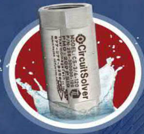
Hot Water Recirculation

In 2012, CircuitSolver® was developed to conquer the challenges inherent to conventional manual balancing valves. As the market's first thermostatic balancing valves used for domestic hot water recirculation, CircuitSolver® balances a system based solely on temperature as opposed to pressure or flow to guarantee hot water at every fixture . Dynamically balancing a system, CircuitSolver® ultimately ended complaints about the lack of hot water, and eliminated balancing processes and callbacks.