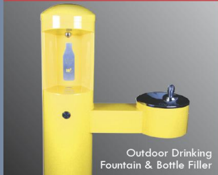
Outdoor Drinking Fountain & Bottle Filler