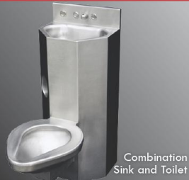
Combination Sink and Toilet