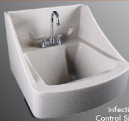
Infection Control Sink