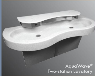
AquaWave® Two-station Lavatory