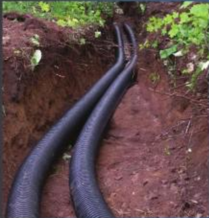
Ecoflex® pre-insulated piping

We don't just make piping. We make progress. We offer smart water and energy solutions that solve customer problems, build their businesses and drive our industry forward.