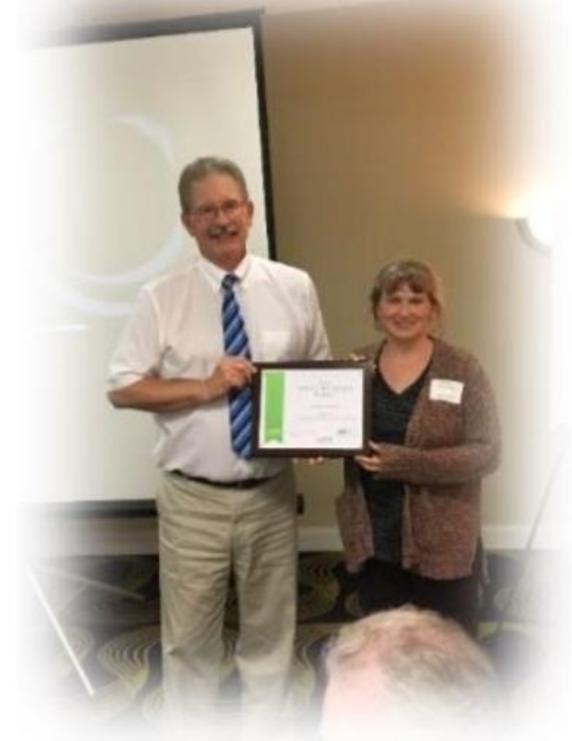
Plaque presented to Rochester Chapter for stepping up and filling in for Pittsburgh and Johnstown as the host of the 2019 Region 2 President's meeting.