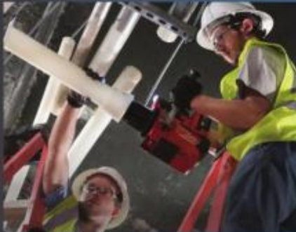
Commercial PEX plumbing